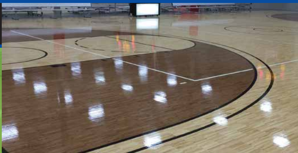
One Directional Pattern