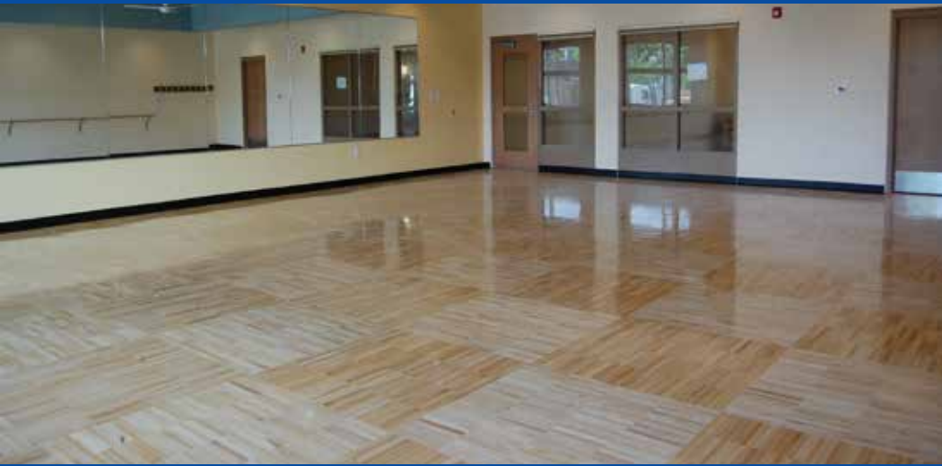
Boston Square Pattern